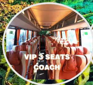
VIP 3 SEATS COACH