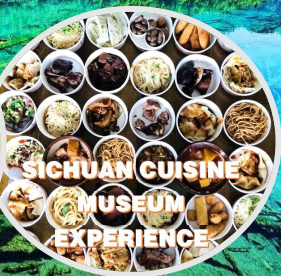
SICHUAN CUISINE MUSEUM EXPERIENCE