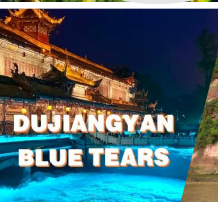
DUJIANGYAN BLUE TEARS