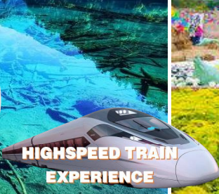
HIGHSPEED TRAIN EXPERIENCE