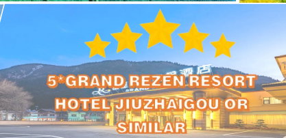
5* GRAND REZEN RESORT HOTEL JIUZHAIGOU OR SIMILAR